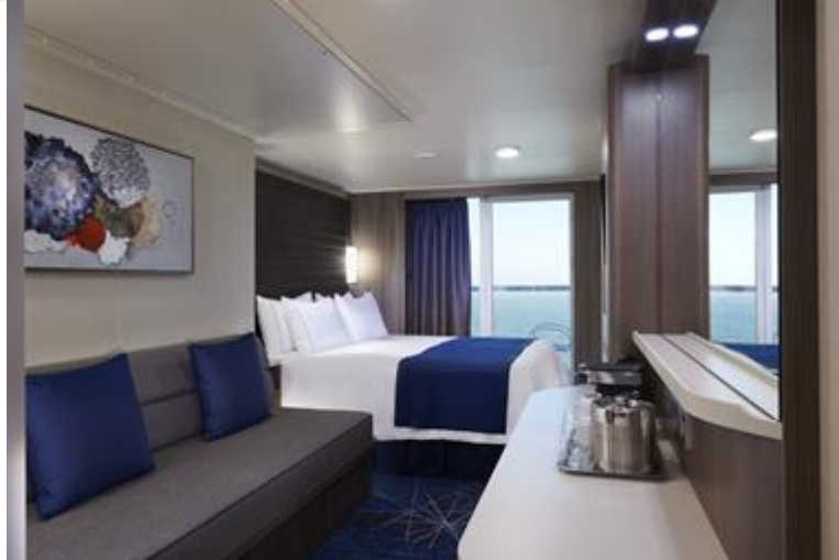
Balcony Stateroom/ Code: BB